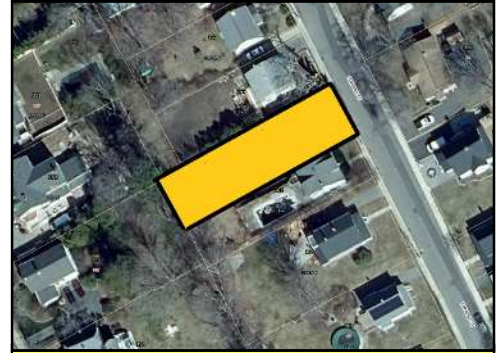
52 EMMONS ST.