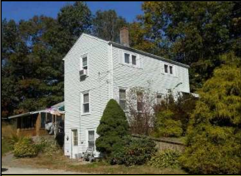
41 BEAVER ST.