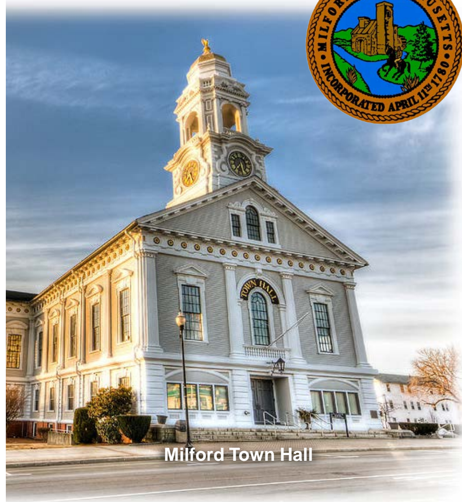
Milford Town Hall